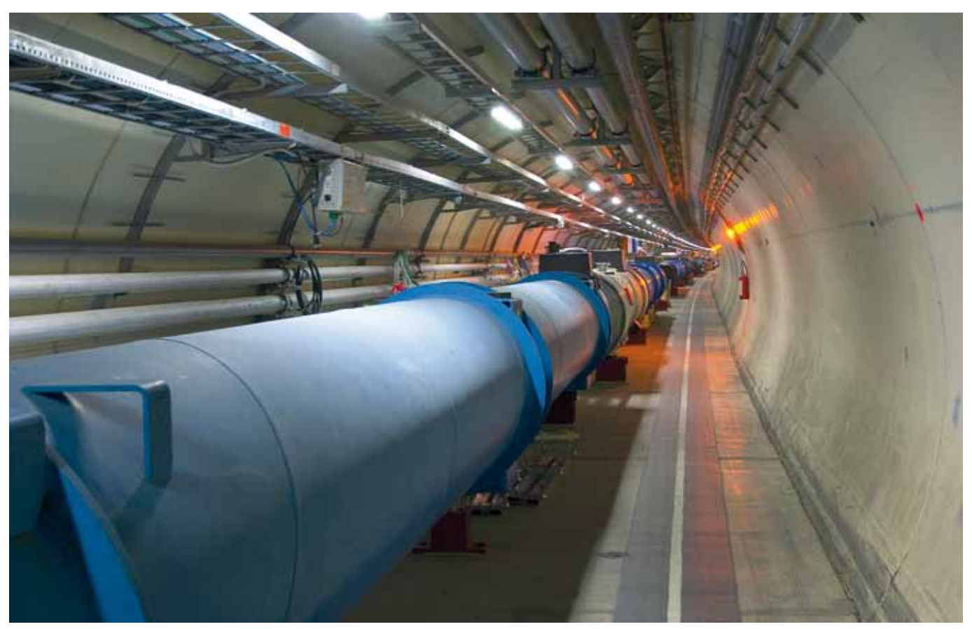
HLC CERN accelerator